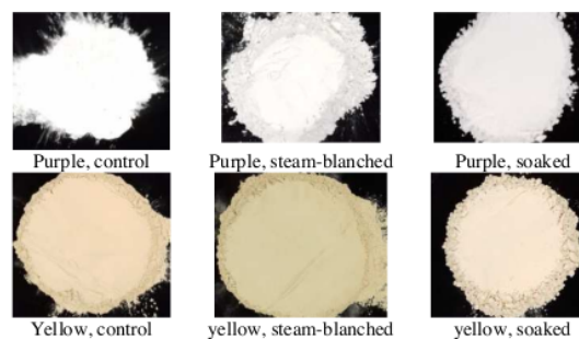
Fig. 1 Starches from the extraction of Dioscorea alata 's tuber using 3 methods of extraction

Swelling power (SP) is known to relate to amylose content, water holding capacity of starch molecules, hydrogen bond, and degree crystallinity of the starch granule. In this research, the water contents of starch were not significantly different ( p>0.05 ) ranging from 8 to 11%(wb) (Table 2). Swelling power of the starches from present experiment was in the range 2 to 10 for purple tuber and 2 to 14 (g/g) for yellow tuber. This results were lower than previously published where SP D. alata was in the range 3 to 17 (g/g) [5].