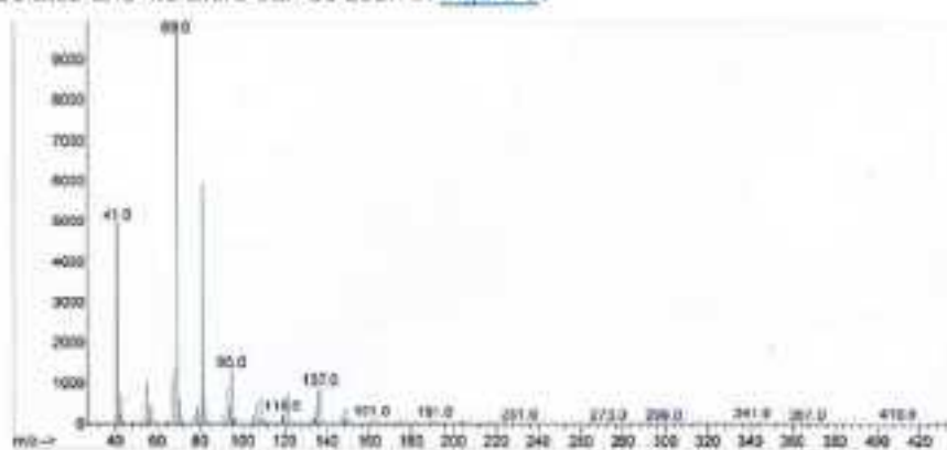
Figure 3. Spectrum GC-MS of isolate F211

To confirm the results of our FT-IR analysis, the characterization was carried out using the GC-MS spectrophotometer, to know the molecular weight of the compounds was obtained. The isolate that was characterized showed the pattern of fragmentation of MS data with molecular ions valued at m/z 410.0 which had similarities with MS data of squalene compounds obtained from Saussurea obvallata extract. 16 The pattern of fragmentation between isolates and literature can be seen in Figure 3 .