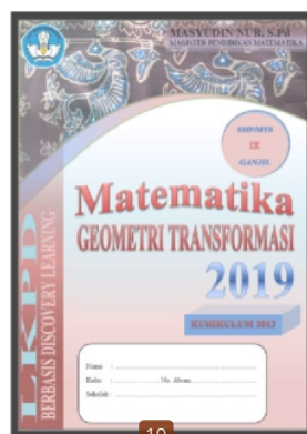
Figure 2: Cover of Student Worksheet

Here is some student work sheet that are used to improve student's mathematical creative thinking skills: