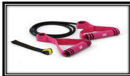
Figure 1. Resistance Band

training loads, to improve physical abilities in the limbs we want such as arms, legs, and abdomen. Apart from that, it can also form flexibility in various parts of the joints and to stretch the muscles in our body parts as well as relax certain body parts that are very instrumental in carrying out movements in various sports (Barbosa et al., 2019).