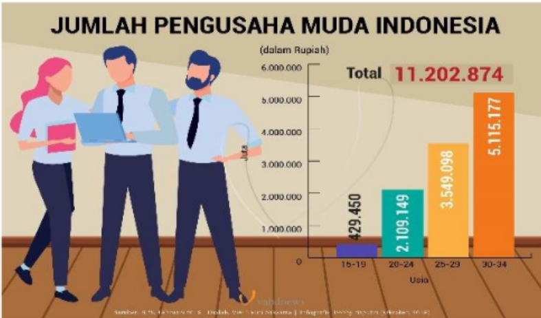
Figure 1. Number of Indonesian Young Entrepreneurs 2019

With the growing number of MSMEs in Indonesia, there is a role for the younger generation behind it. Based on the data above, the number of young entrepreneurs in Indonesia with an age range of 15-34 years 11,202,874 people., a generation synonymous with creative and innovative characters. The development of increasingly developing technology very much supports the character of the young generation. The results of the study state that one of the successes of a business is supporting good and well-targeted technology. In 2017, 8 million MSME units utilized digital technology. As many as 3.79 million MSME units have used online platforms in marketing their products. This number is around 8% of the total MSME actors in Indonesia, which are 59.2 million units (Yustini, 2018).