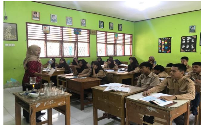
Figure 1. Small group evaluation documentation

evaluation stage of the student's worksheet, the student response results were obtained with a percentage of 84.68%. Based on the practicality percentage interpretation criterion, the group evaluation (student responses) is obtained with practical does not need revision. So based on the calculated data from the teacher's assessment and student responses above, it can be obtained that the learning tools implemented in the inquiry-flipped classroom model to increase student arguments on addictive substances and additives meet practicality criteria, namely practical or can be tested without.