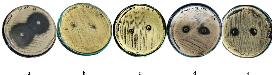
Figure 2. Antibacterial activity evaluation of peel-off gel mask formulation using Gerga orange peel kombucha against Propionibacterium acnes

The results revealed significant statistical differences among the formulations, with the higher concentration of HPMC yielding better outcomes than the lower concentration. HPMC not only serves as a gelling agent but also plays a crucial role in various antibacterial applications. It enhances the stability and antibacterial properties of formulations, thereby increasing their efficacy [29].